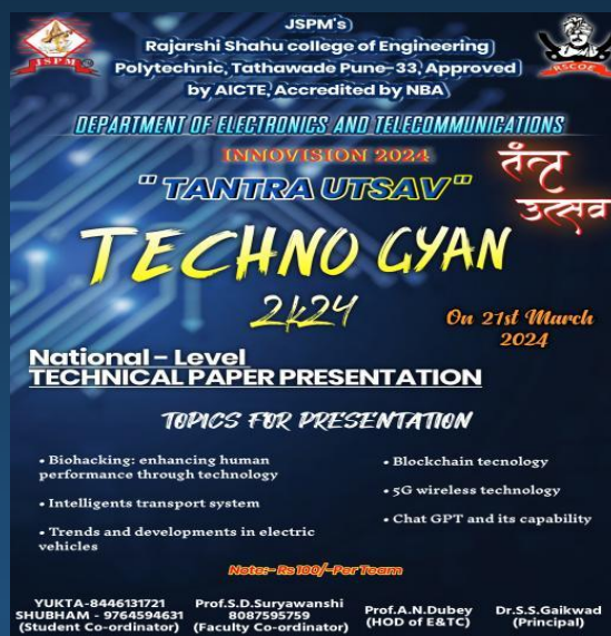
Newsletter 2023-24 4: Techno Gyan

More such pictures are attached on the next page.