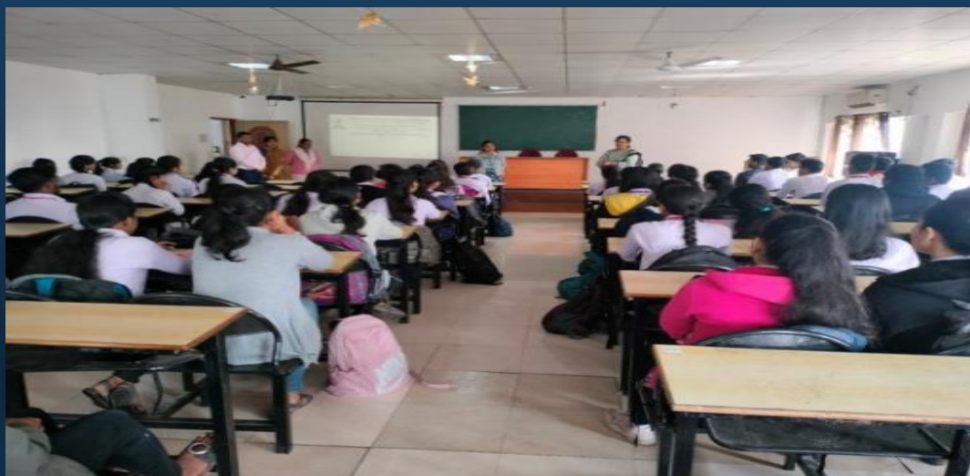
Newsletter 2023-24 1: Guest Lecture photograph.