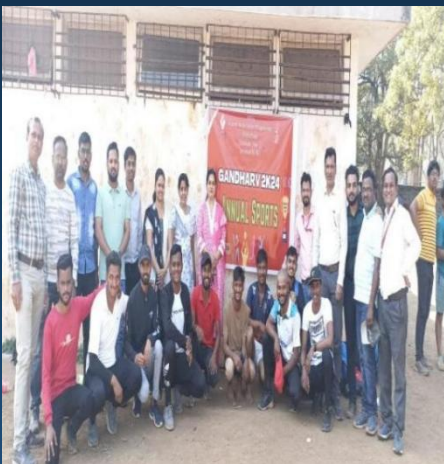
Newsletter 2023-24 6: Gandarv 2k24