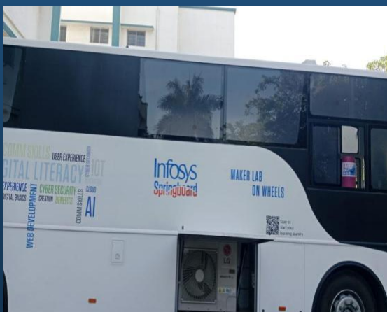
Newsletter 2023-24 7: Workshop on Infosys Spring Board