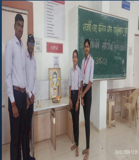
Newsletter 2023-24 5: Jayanti Celebration